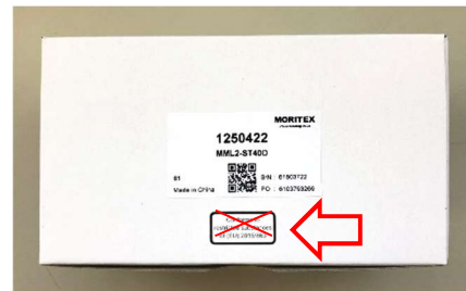
Display example on individual packing (discontinued)