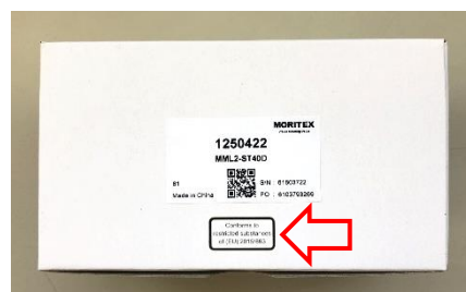
EX) The label on package