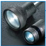
LED Spot Projectors MSPP p.146