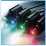
High Power LED Spot Illumination MCEP p.100