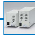
LED Controller for MG-Wave® MLEK

A080W Analog Series p.152 A080W Digital Series p.152 A230W Analog Series p.152 A230W Digital Series p.152 Multi Channel Series p.155 High Wattage Series p.156