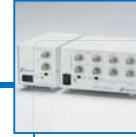
LED Controller for MCEP/MSPP Series MLEP

A035W Analog Series p.149 A035W Digital Series p.149 A070W Analog Series p.149 A070W Digital Series p.149