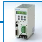
LED Controller for CompaVis®