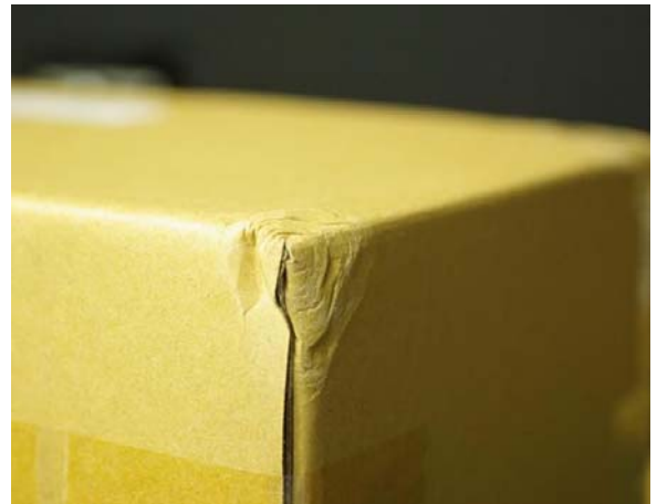
Picture 5. Front left bottom angle of individual box. (After Falling Test)