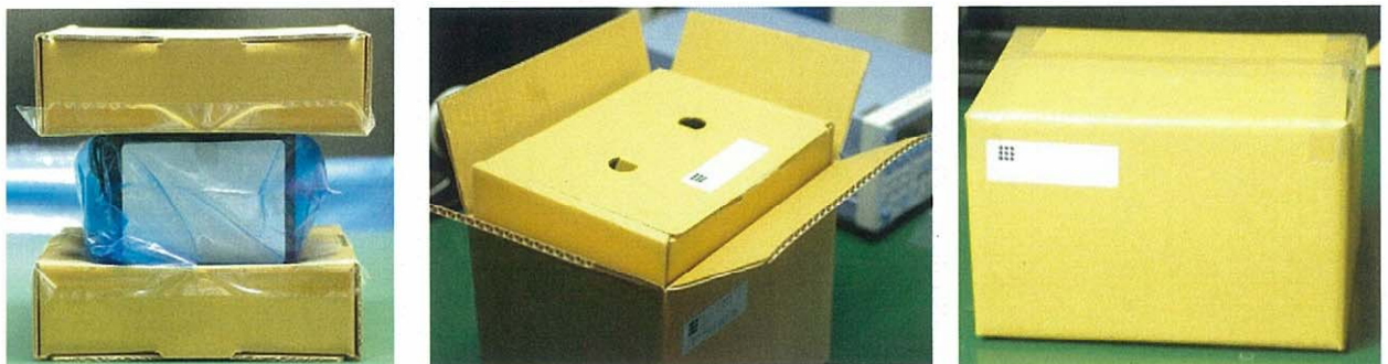
Picture 3. Large size(L260mm × W200mm × H170mm or L260mm × W200mm × H210mm)