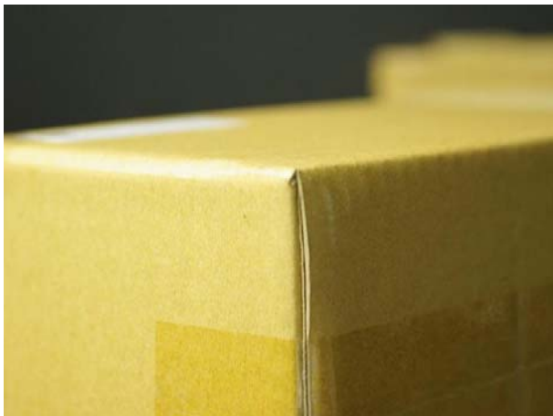
Picture 4. Front left bottom angle of individual box. (Before Falling Test)

Even a dent was found, the products in the box was not seen from outside, and taken out from the boxes. In addition, there was no defect on appearance and function of the products.