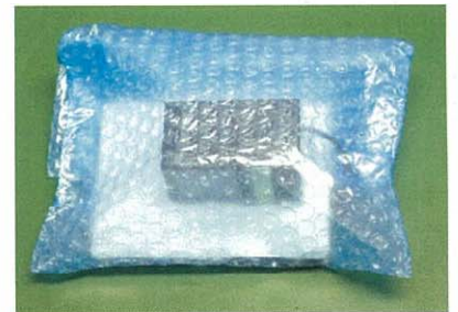
Picture 1. Current packing method

The products used to be packed by packing bags(antistatic Air Cap bag) shown in picture 1.